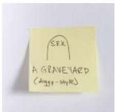
Where's the craziest place you've had sex?